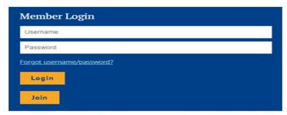
Step 2: Enter your email address in the Username field and click "Email Password".