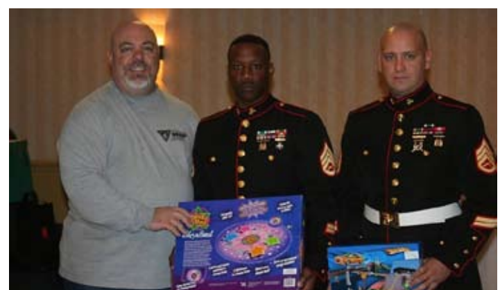
continued on page 2

This year's sessions were especially important because of the many changes in the industry. Sessions were