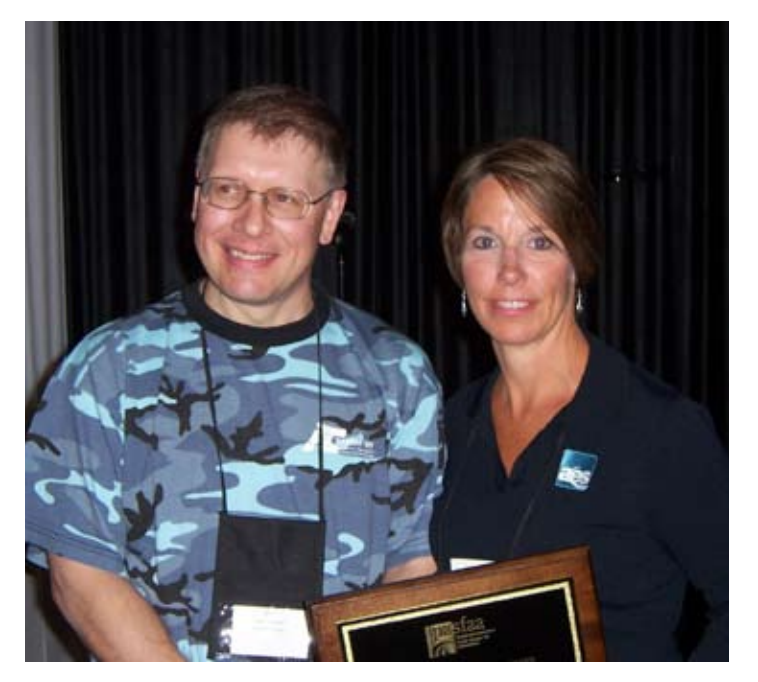
continued on page 8